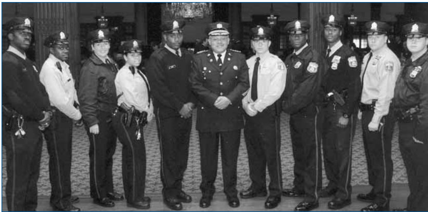
The Brave Blue Line. Police Commissioner Ramsey is flanked by men and women from his department.