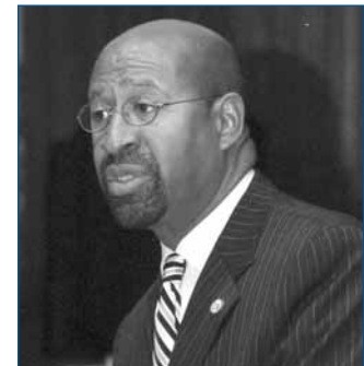
Philadelphia's Mayor, Michael Nutter congratulated The PENJERDEL Council on its 55th Awards Lunch and noted the Award recipients: The Men and Women of the Philadelphia Police Departments, Urban Engineers and PECO.