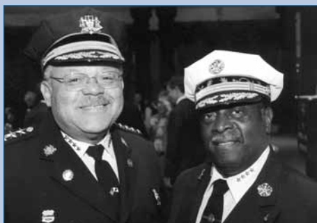
The best of the best: Philadelphia Police Commissioner Charles Ramsey along with Fire Commissioner Lloyd Ayers accepted Citizens of the Year Awards. The Commissioners were pleased to accept the awards in honor of the men and women of their departments.